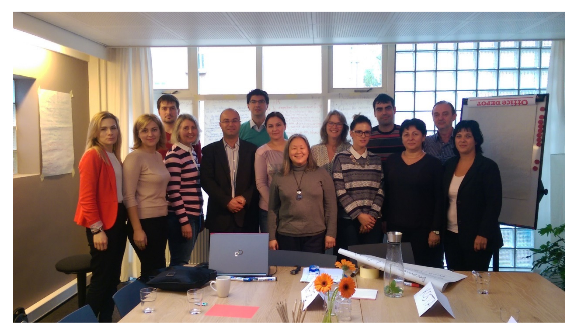
Participants of the lessons learned meeting October 2016

In April 2016 the Netherlands Court of Audit hosted a moderator training for Bulgaria, Bosnia & Herzegovina and Moldova. The training gave the participants a sound basis to moderate the IntoSAINT workshops in their own countries. During the workshops in Bulgaria and Bosnia & Herzegovina a trained moderator from the partner country was involved. In October 2016 a lessons learned meeting was held in the Hague to exchange experiences and good practices and to make a plan on how to follow up the recommendations made by the participants in the workshop. This will help to make the integrity awareness ongoing and sustainable.